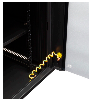
RWM9 Earth Wire